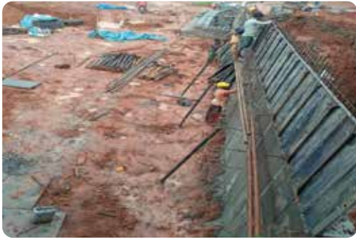
JYOTHI Engineering College Sports Complex