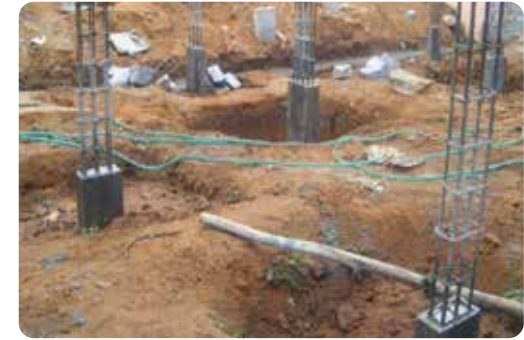
Desamangalam Masjid Building