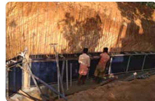
Vettath Road Side Wall