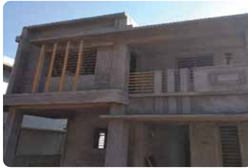
VICTORIA Residential Complex