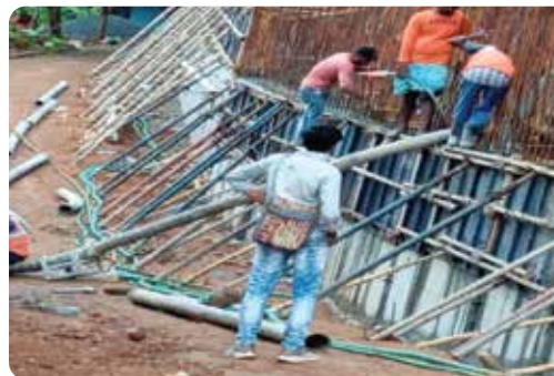
Varavoor Retaining Wall